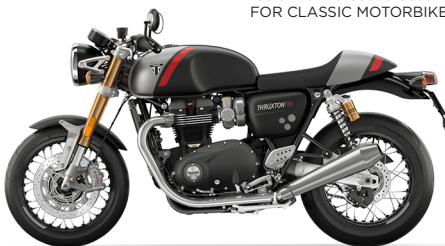
Ceramic Protective Coating FOR CLASSIC MOTORBIKES