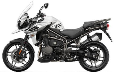
Ceramic Protective Coating FOR SPORT MOTORBIKES