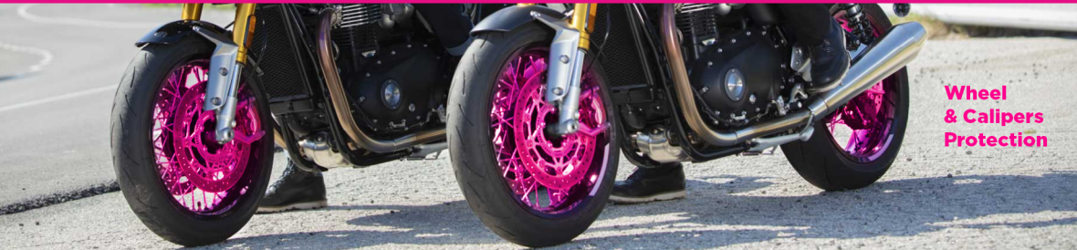
Wheel & Calipers Protection

TALK TO OUR SALES TEAM ABOUT PROTECTING YOUR LATEST INVESTMENT AGAINST STONE CHIPS, SCRATCHES AND WEATHER FALLOUT!